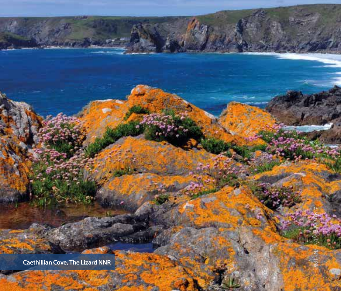
Caethillian Cove, The Lizard NNR

We want to inspire people, promote learning, and encourage involvement in the wider landscape.